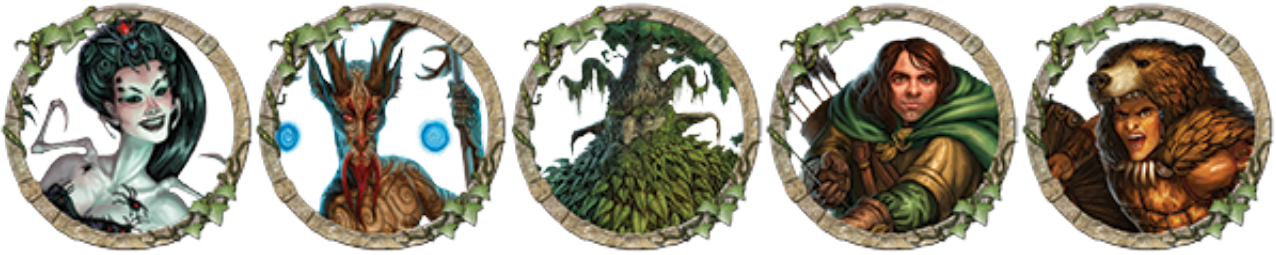
Spider Queen Leywalker Ancient Oak Scout Totem Warrior

A custom-fitted map board and over 100 new cards bring this magical forest vividly to life. Five brand-new characters offer fantastic new playing experiences.